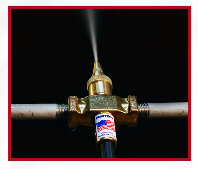
Model: Atomizing (directed spray) Droplet size: 60 – 200 microns Liquid viscosities up to 1100 cP.