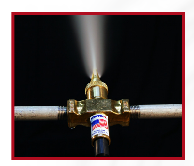
Model: Fogging (directed spray) Droplet size: 20 – 60 microns Liquid viscosities up to 1100 cP.