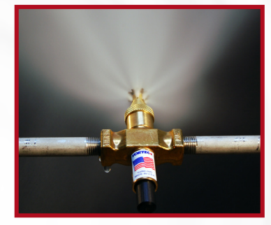
Model: Humidifying (wide spray) Droplet size: 20 – 200 microns Liquid viscosities up to 100 cP.

For more information on Vortec Nozzles, click here or scan this QR code with your smart phone.